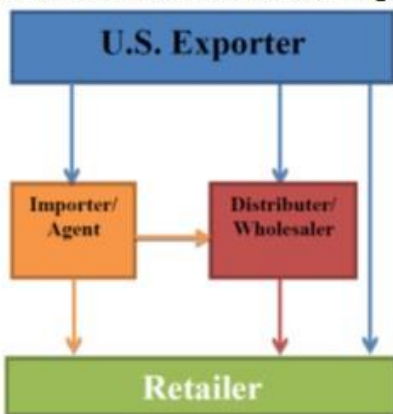
Distribution Channel Flow Diagram

Large supermarket chains import directly, as well as buy from importers or wholesalers. Others usually buy only through importers or wholesalers. In addition to large supermarket chains, which import directly, there are about 300 importers.