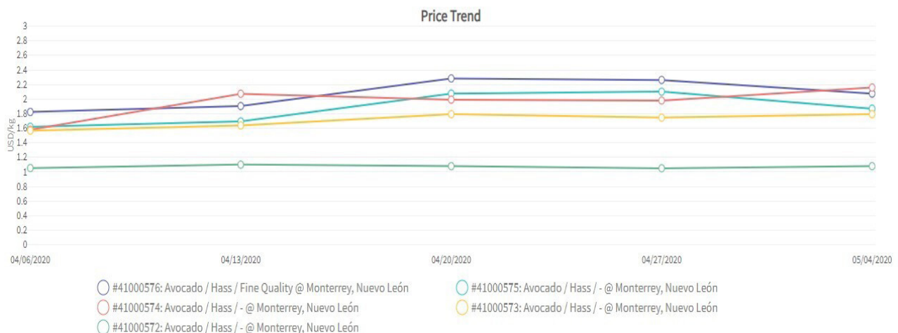
Graph 2. Price trend of Mexican avocados

spike related to pandemic lockdowns. While there has been slightly decreased demand from the pandemic due to the impact on the catering and hospitality industry, it is not thought to be detrimental to the Mexican avocado sector.